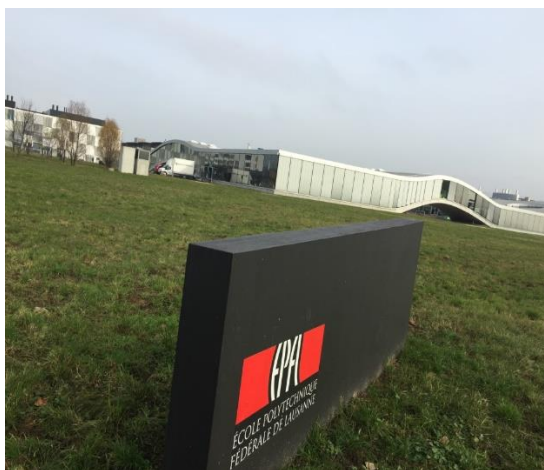
Entrance of EPFL

In addition, this valuable experience can help me achieve new perspectives on things by studying with people from diverse backgrounds. I have learnt a lot of merits from others, like persistence and courage. I have also become more confident when facing a challenge. I am quite convinced that this studying experience will benefit my future professional development.